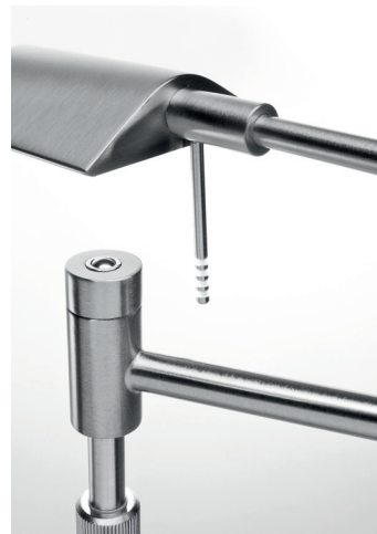
Detail of P1 Dimmer