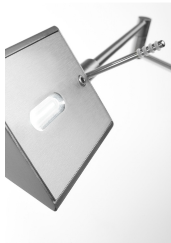
Detail of LED Reflector