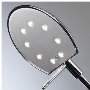
Detail of LED Reflector