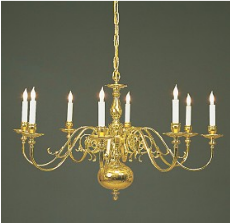
7312/8 Polished Brass