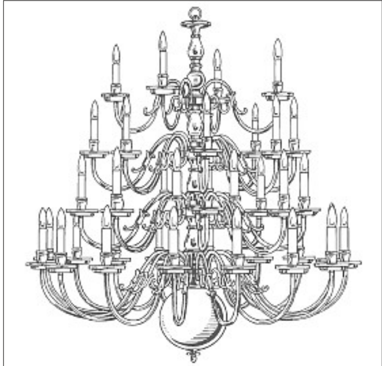
Inquire about our custom chandeliers

The Hamburg Series is a varied and complete Architectural Flemish Series suitable for the most demanding situations.