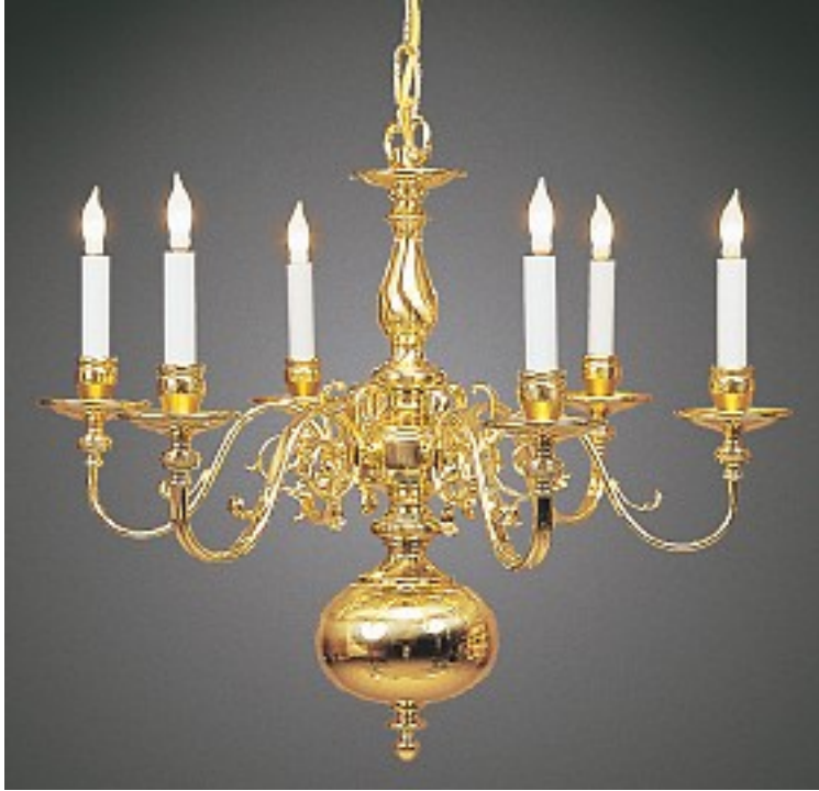
7312/6 Polished Brass