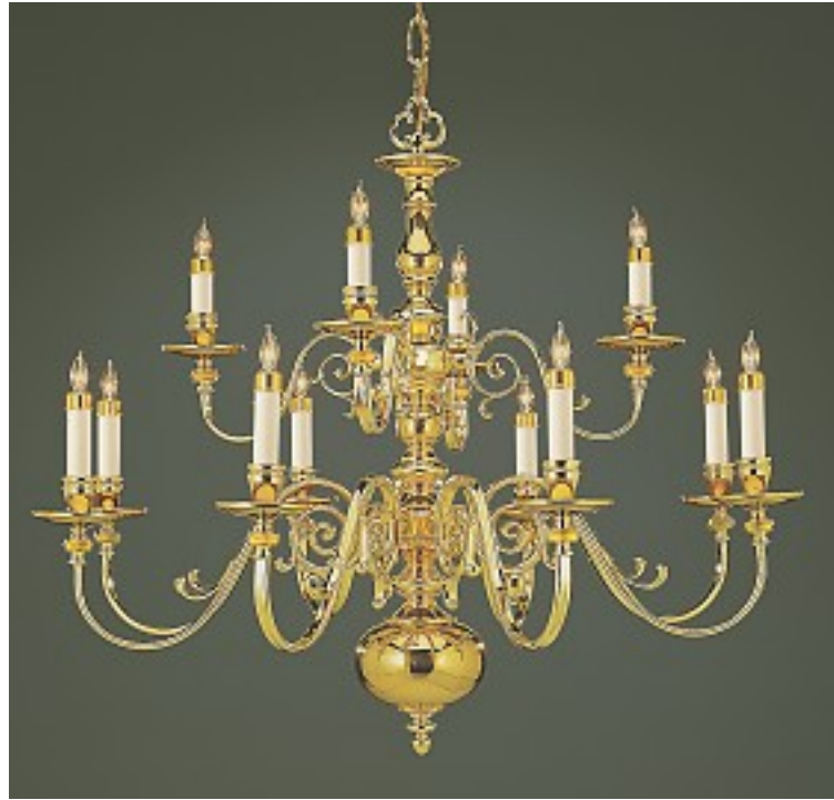
7313/8+4 Polished Brass*