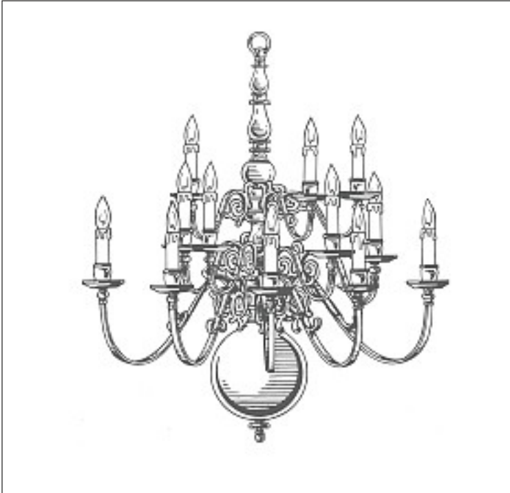
Inquire about our custom traditional wall sconces