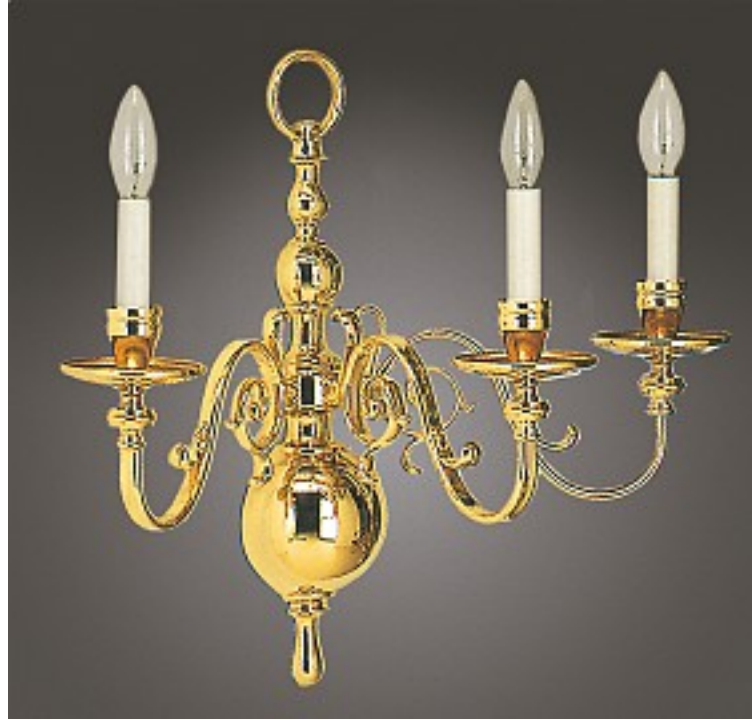
7333/3 Polished Brass