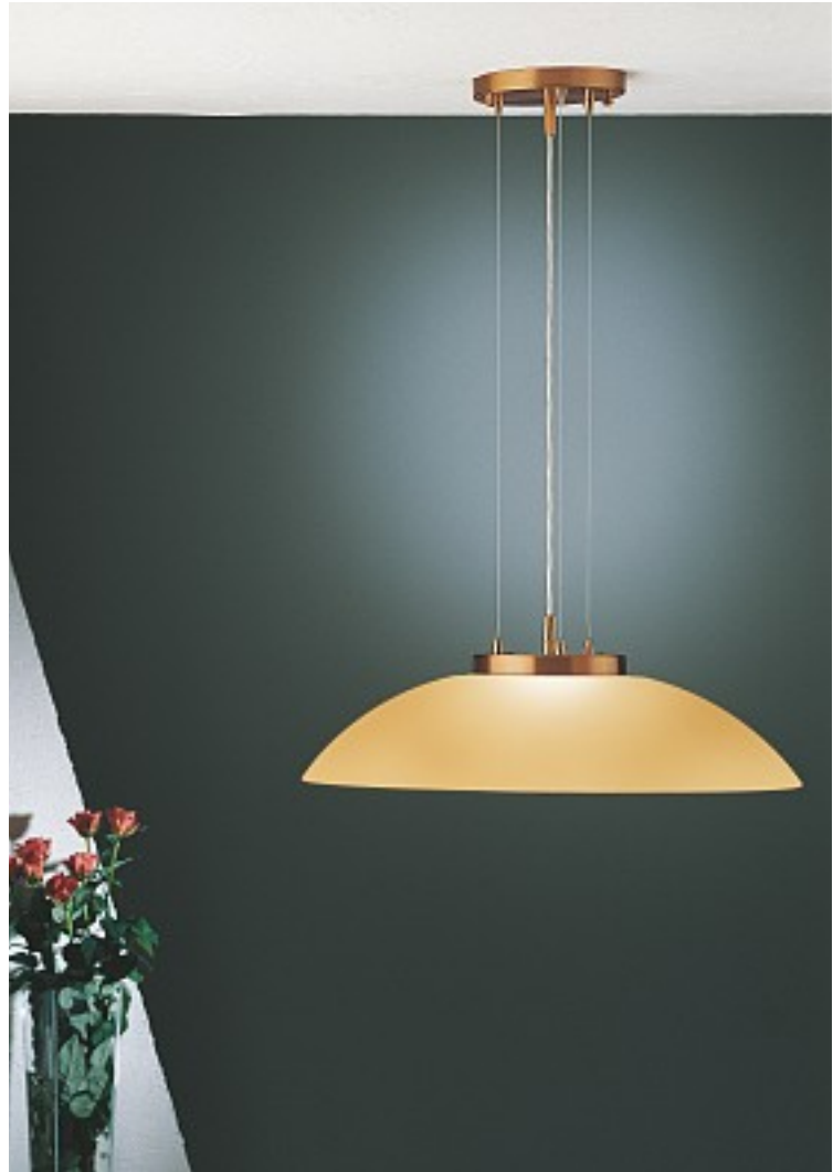
5123/3 Antique Brass with Champagne Glass