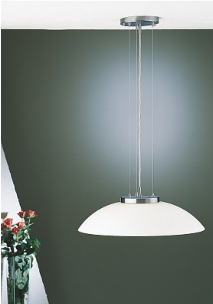
5123/3 Satin Nickel with Satin White Glass