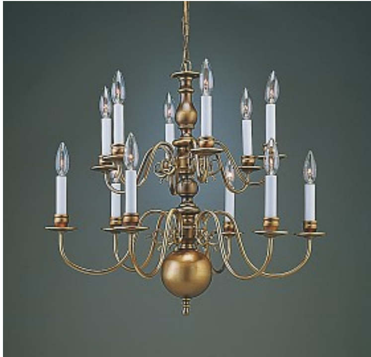
2312/6+6 Antique Brass