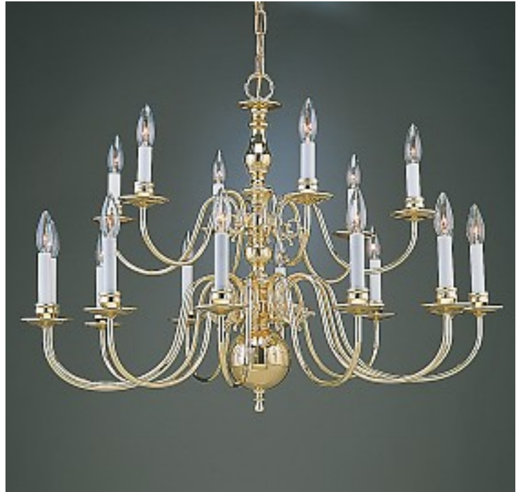
2318/12+6 Polished Brass